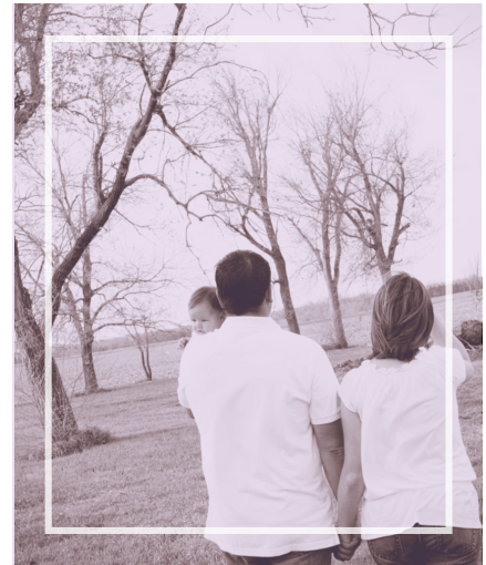
I Was Looking for a Miracle