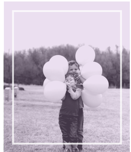
Nine Years of Letting Go