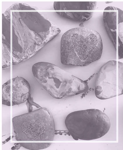
Wind Storms & Rock Piles