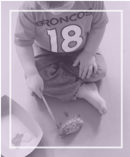
Happy Heart Rocks